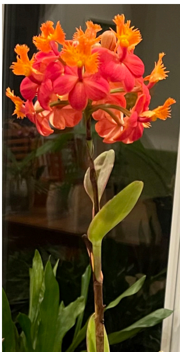
Epidendrum Pacific Blaze 'Orange #2'