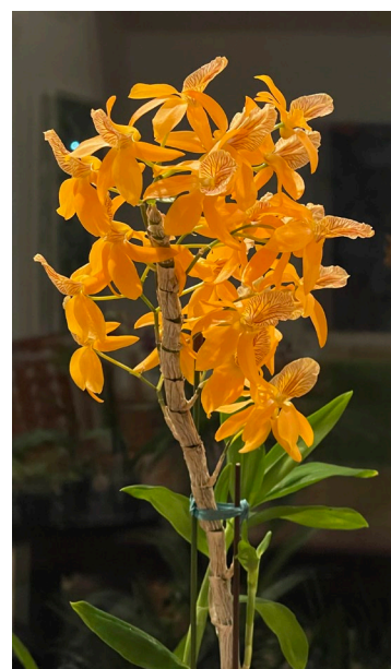
Dendrobium Sheng Yi Bumblebee 'Sunkiss'