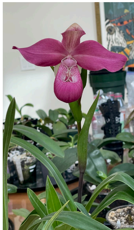
Phragmipedium Munekazu Ejiri