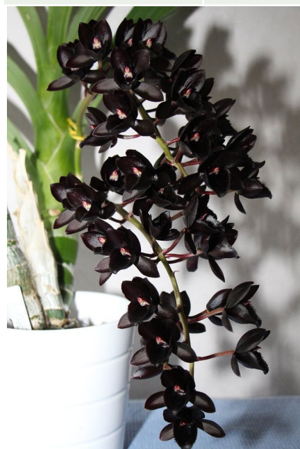
Fdk. After Dark 'SVO Black Pearl'