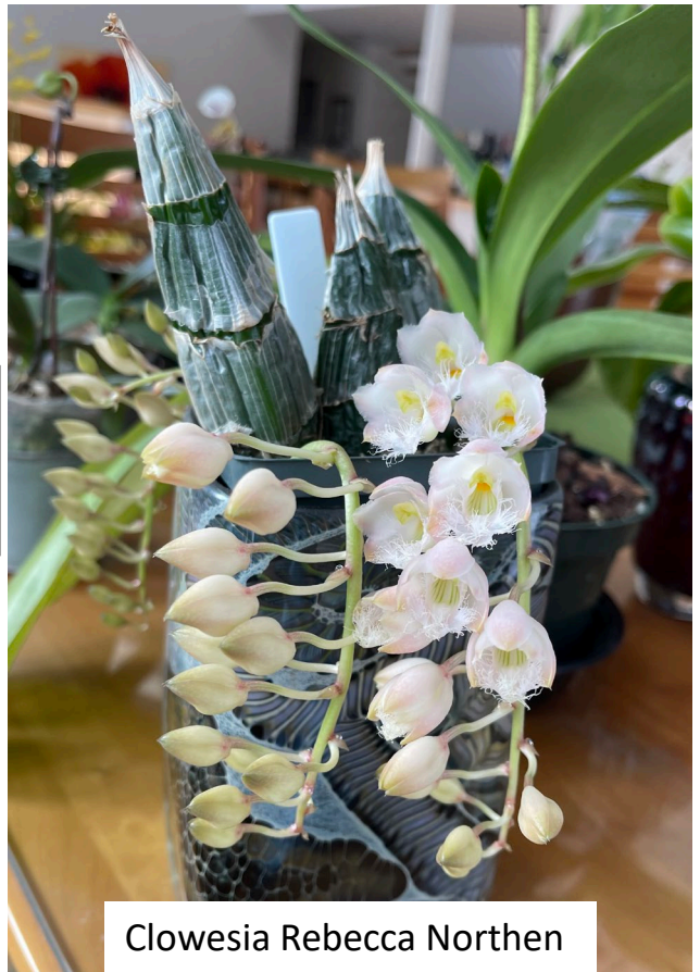
Clowesia Rebecca Northern

March 30-31 (to be confirmed): Michigan Orchid Society: Local 98 Plumbers Union, 555 Horace Brown Dr., Madison Heights