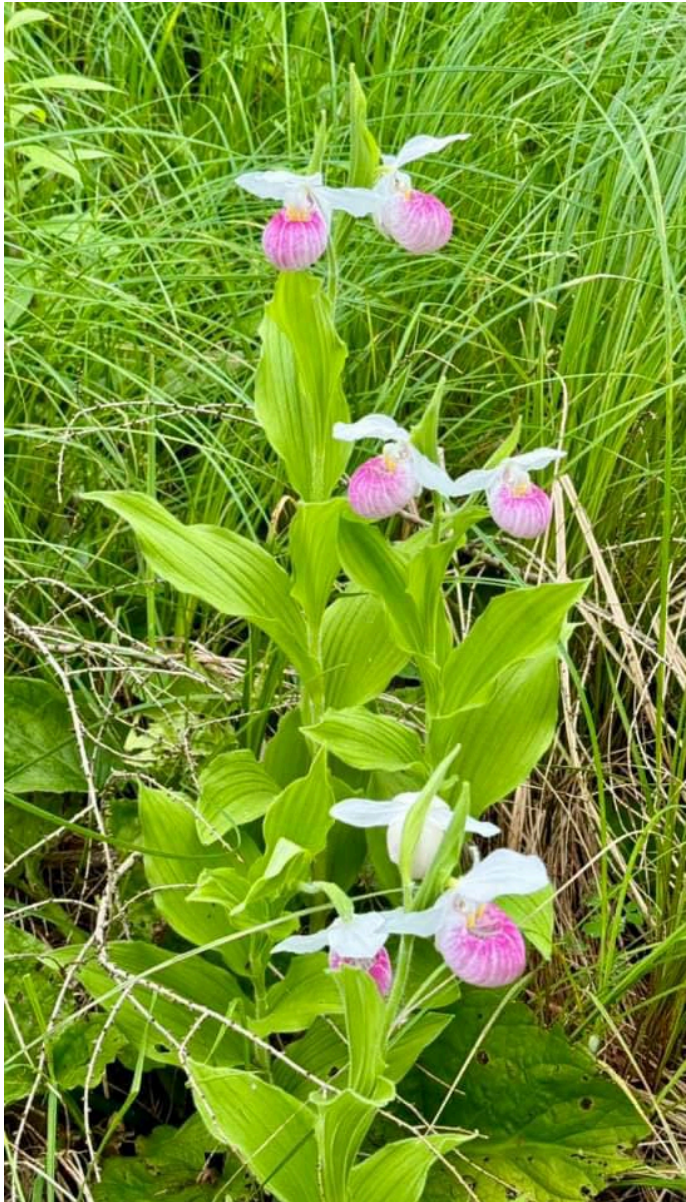
Cypripedium reginae, Jun 3 rd, Sharon Hollow

A few June-blooming native Michigan orchids!