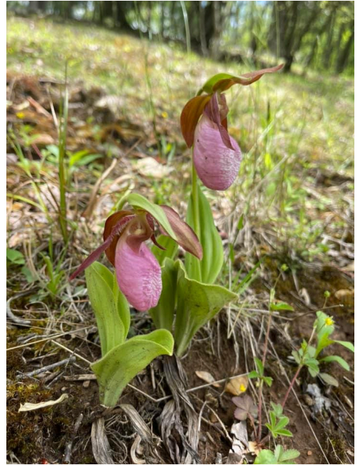
Cypripedium acaule posted by one of Dave's friends, northern Michigan

A few June-blooming native Michigan orchids!