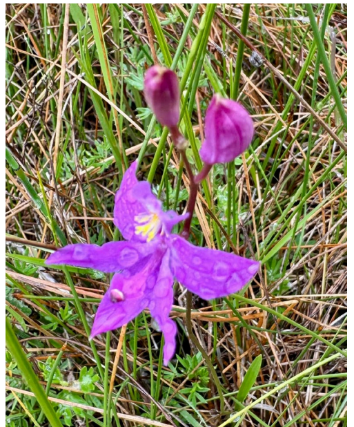
Calopogon tuberosus, Jun 5 th, Arnold Fen