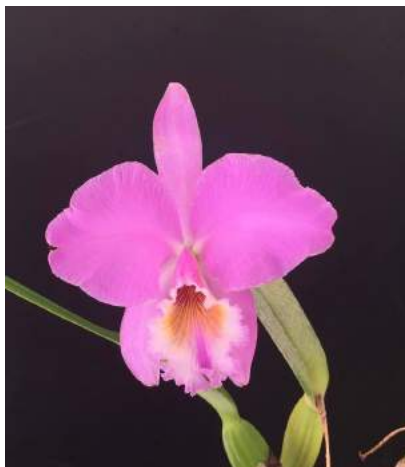
Orchid: Cattleya labiata