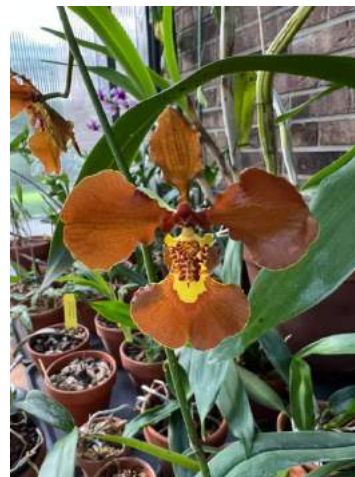
Orchid: Oncidium crispum