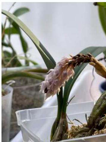
Orchid: Bulbophyllum lilacinum