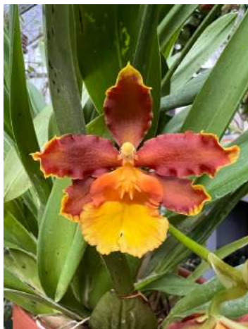
Orchid: Odontocidium Catantante 'Pacific Sun Spots'