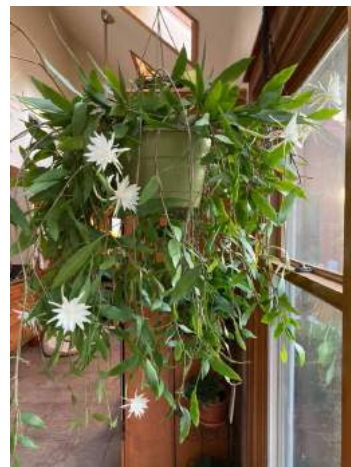
Plant: orchid cactus