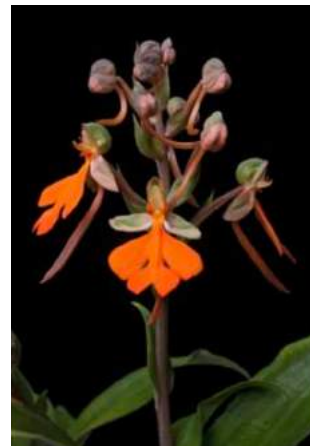
Habenaria rhodocheila