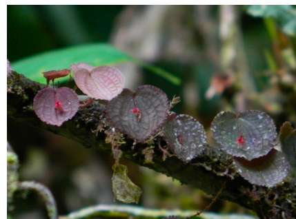
Orchid