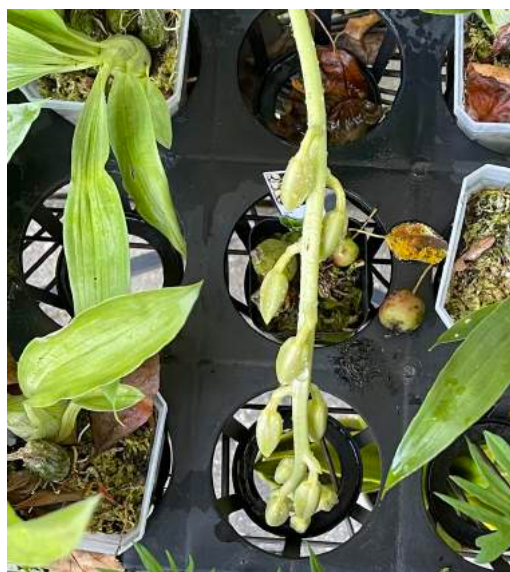
Clowesetum "Upper Echelon"