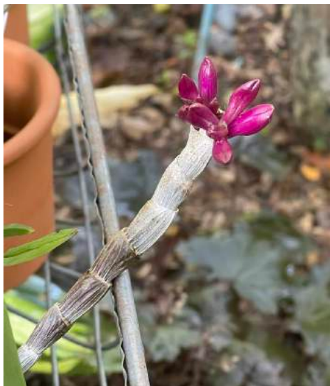
Dendrobium Victoria Pinky