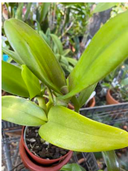
SVO 7101 in sheath!