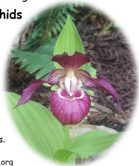
Cypripedium Pixi 'MoJo' AM/AOS

Location, times, costs, topics and daily schedule at www.gljc.org